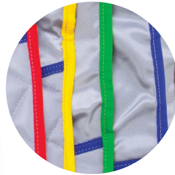
Coloured binding tape identifies sling size