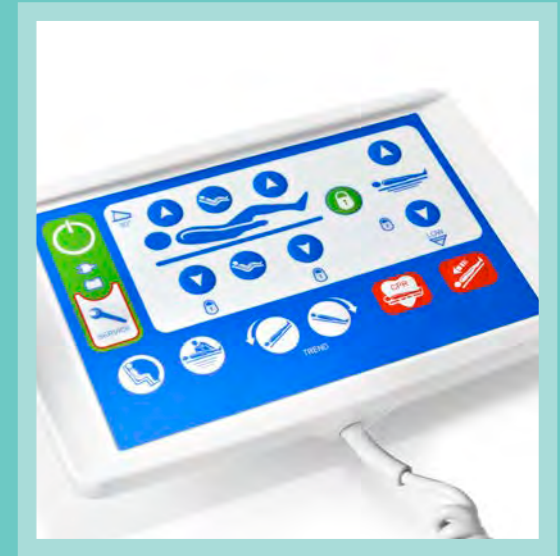
Attendant Control Panel with an intuitive push button layout.

The TRANSLATION of the backrest ENHANCES BREATHING by reducing pressure on the plexus area.